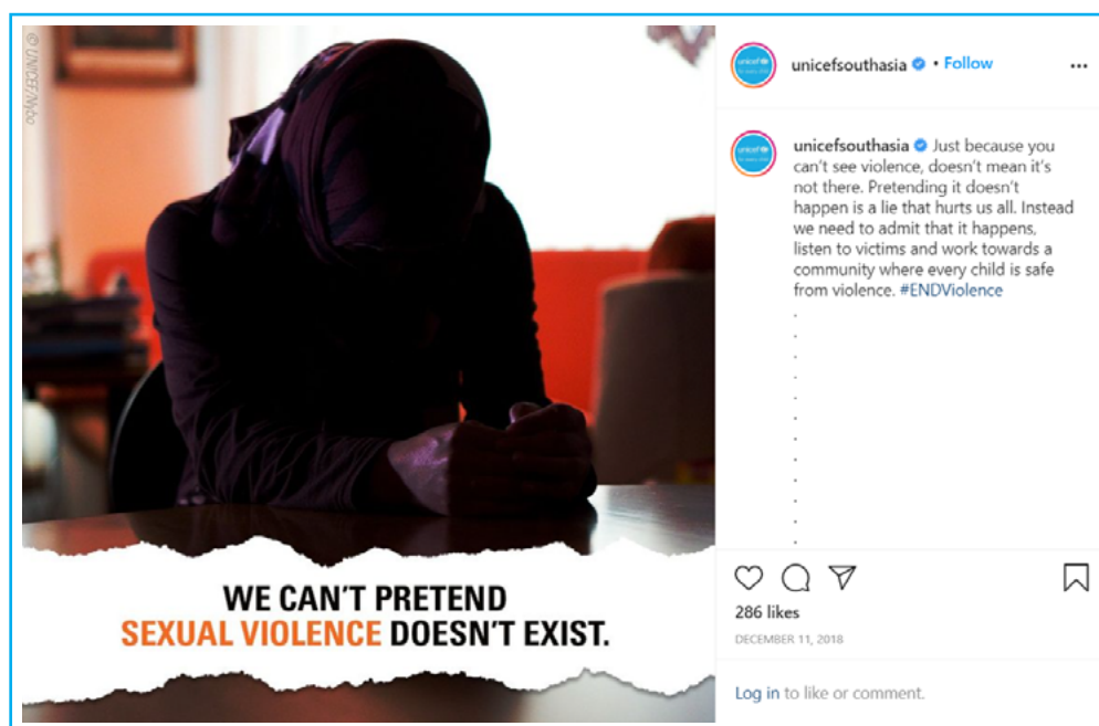
Above: example of how to obscure someone's visual identity in a photograph for confidentiality.