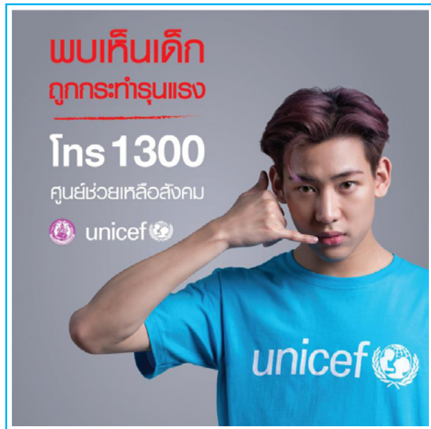
Above: example of a call-to-action in a campaign urging the Thai public to call the Government's Helpline 1300 if they suspect any forms of violence against children.