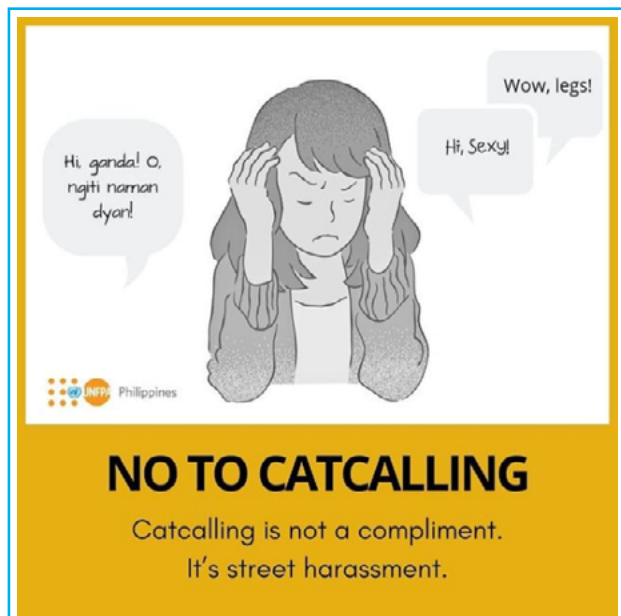
Above: example of a social media card that conveys an important message in an easy-to-understand format.