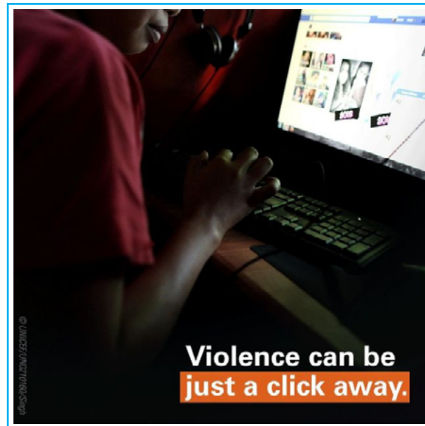
Above: example of a social media card showing another form of violence, online bullying.