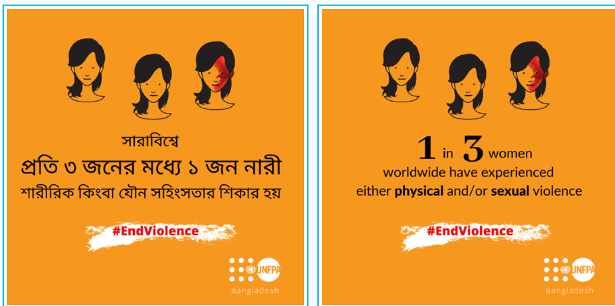
Above: (left) example of information, education and communication (IEC) content in local language; (right) English version.