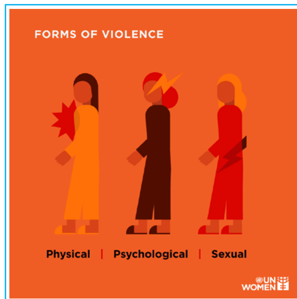
Above: example of a social media card highlighting multiple forms of violence without graphic depictions that reinforce stereotypes.